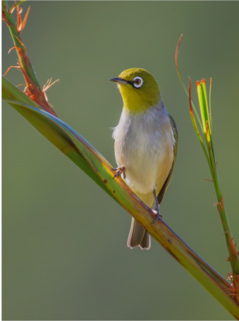
Silver eye posing 5313 Merit Martie Labuschagne GMAPS AFIAP