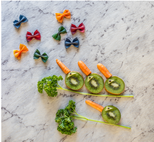
Birds watching butterflies Merit Caryn Alner