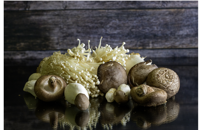
Food Reflections Merit Shaun Blake