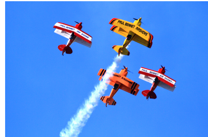
Four in Formation Merit Don Featherstone