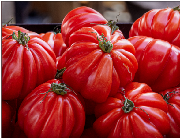
Stacked Up Merit Sheila Crisp