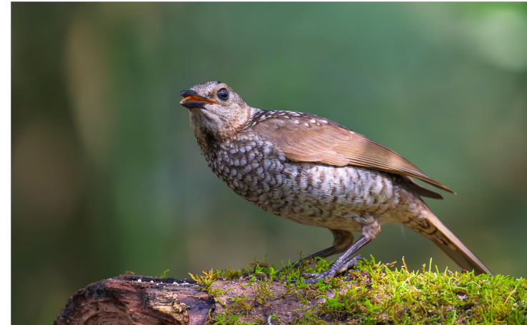
Female Regent Bower bird 2388 Merit Stephan Labuschagne AFIAP GMAPS