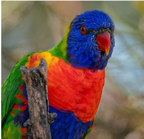
I've Been Eating Merit Peter Simmonds